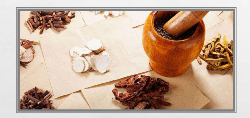
TRADITIONAL CHINESE MEDICINE EXPERIENCE