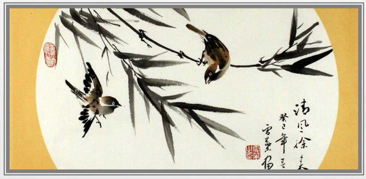
CHINESE HANDWRITING AND PAINTINGS PRACTICE